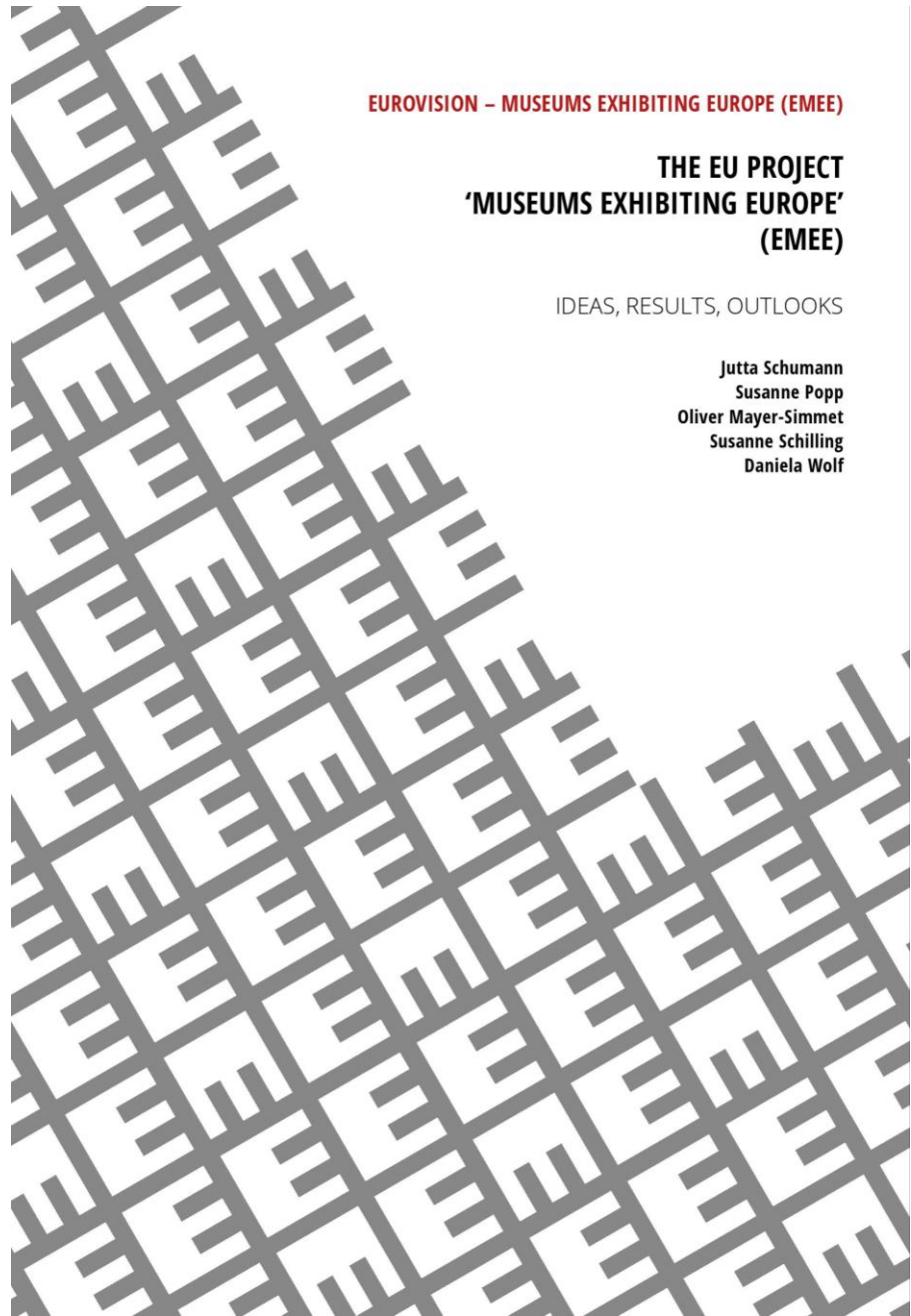
Cover of The EU Project 'Museums Exhibiting Europe' (EMEE). Ideas, Results, Outlooks

EuroVision Lab.s throughout Europe, spreading EMEE's ideas and concepts. Later on, the building of the widespread EMEE network is explained and additionally the results of the evaluation of the EMEE concept by museum experts are presented. The last two chapters finally give a short summary of the aims and outcomes of the four-year-project, that leads to the recommendations for stakeholders and policy-makers, based on the experiences with the EMEE project. The final EMEE publication will be officially released during EMEE's final conference in Brussels (27 th -29 th September 2016) and will be issued as a print edition but will also be available online on the project's website free of charge ( http://www.museums-exhibiting-europe.eu ).