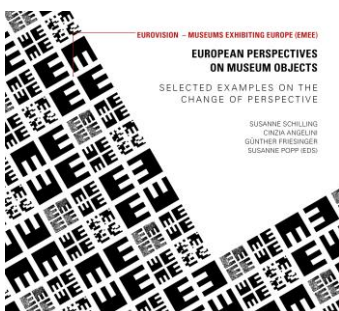
Cover of EMEE Toolkit 6

As an illustration of the practical implementation of Toolkit 1-5, the so called Exemplary Units were developed to test the concept of Change of Perspective. Each Unit applies the EMEE Toolkits 1-5 to museums objects or groups. Museum objects are represented from early until contemporary history, the ten selected examples include objects and topics from the Chalcolithic Period up to the present day. Among the chosen objects not only items from Europe but also items originating from other continents are taken into account, because many European museums own and exhibit objects from outside Europe.