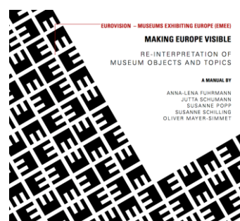
Cover of EMEE Toolkit 1

The manual 'Making Europe Visible' predominantly focuses on the first of the three Changes of Perspectives of the EMEE concept: by re-interpreting museum objects and topics the trans-regional European perspective shall gain access to national and regional museums. The Toolkit provides eight approaches on how to re-interpret local museum objects in a European way.