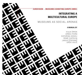
Cover of EMEE Toolkit 2