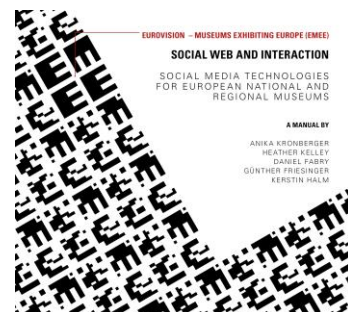
Cover of EMEE Toolkit 5

This Toolkit offers guidance in understanding and applying interactive information and social media technologies for European national and regional museums. Web 2.0 technologies are not simply 'nice to have' anymore; instead, it is almost obliged to make use of media channels like these. The goal of using these tools is to spread knowledge and to start a communication process around the museum's topics with visitors and non-visitors on different media channels.